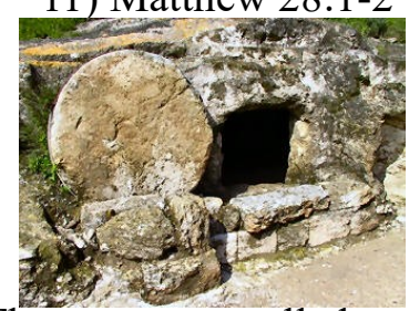
11) Matthew 28:1-2

The stone was rolled away from the door of the tomb.