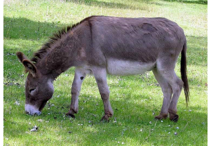
The donkey reminds us of Christ's entry into Jerusalem.