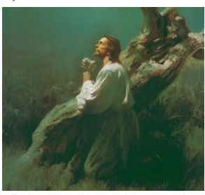
Jesus prayed in the garden of Gethsemane.